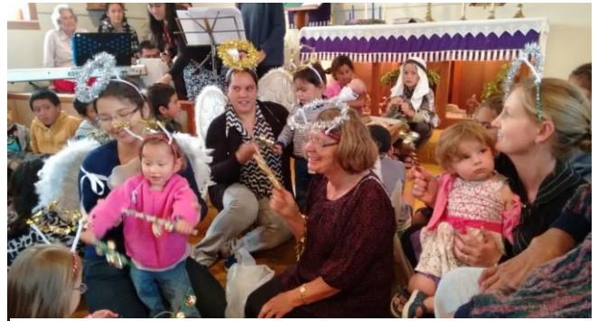
Good News Playgroup perform angel song

A very successful Kai and Carols event was held in mid-December. This is a great annual event and it is so wonderful to see so many people from the community coming join with us in celebrating Jesus' birth. We were very blessed to have the new facilities because the rain fell but we could still hold this event with the additional space we now have. The theme of the service was "200 years of the Gospel in New Zealand", and the children contributed to this through the Good News Playgroup ringing their angel bells to a song and the Sunday evening children performing to an action song. Thanks to all those who contributed in so many ways.