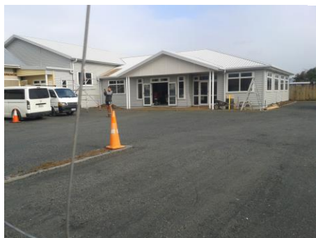
Carpark and entrance to offices and lounge

Fantastic Progress is being made on the community centre. Inside and outside is now painted, the carpark has been prepared for sealing and services such as electricity are all installed. Over the next two weeks the kitchen will be installed, floorings laid and toilets etc going in. By the end of the month the complex will nearly be complete.