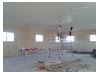
The painting of the hall ceiling

as support from numerous local businesses for which we are grateful. Our planned deficit is now under $45,000! Some of the money we are still to raise is to cover expenses such as blinds for the offices, heating, stackable chairs, trestle tables, kitchen equipment and landscaping. We will not be able to do some of these things until we have raised the money. Please contact us if there was something specific you would like to make a further donation towards.